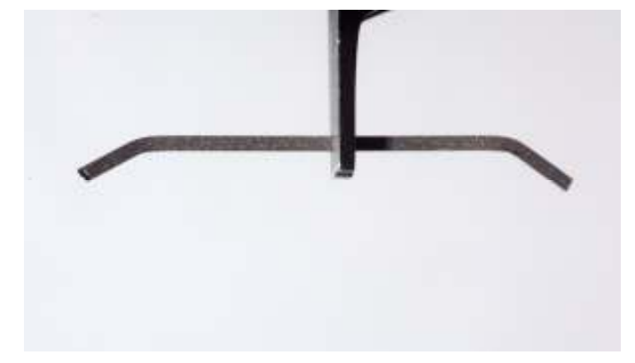
Step 2. Make a 45 degree bend in a gingival direction at the end of the splint, approximately 2-3 mm. This bend helps contour the wire and locks it into the adhesive, preventing any potential sliding.